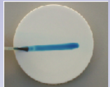
Test ink with plasma treatment

Diener electronic Plasma-Surface-Technology