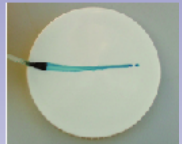
Test ink without plasma treatment